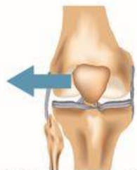
Figure 2 Illustrates abnormal tracking of the knee cap