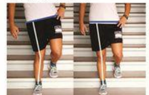
4a. Poor control of hip and pelvis. 4b. Improved control of hip and pelvis. Figure 4 Walking down stairs