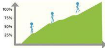
Figure 5 Gradual and safe build up in physical activity levels