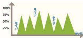
Figure 1 Varied and rapid increases to physical activity levels which can lead to patellofemoral pain

Excessive loading or varied and rapid increases to physical activity which your knee cannot cope with (Figure 1) are thought to contribute to pain development. Poor biomechanics (movement) can also contribute, with the knee cap thought to move toward the outside of the knee (Figure 2), stopping it from tracking normally in its groove. A number of factors can lead to this poor tracking (Figure 3). There are numerous other contributing factors to patellofemoral pain including the structure of your knee, trauma, surgery and systemic disease, which you may wish to speak to your therapist about.